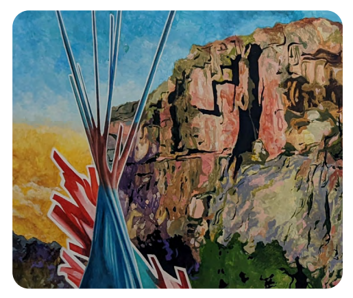
This project is funded by the Government of Canada.